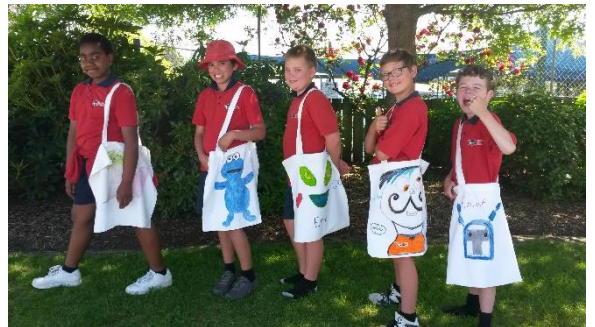
These children learnt how to use sewing machines and have up cycled some old pillowcases to make eco bags

Junior prizegiving (Rm's 1, 2, 3, 4, 6, 7, 8 and 9) will be held in the Grantlea Downs Hall at 2pm on Thursday 12 th December. Those attending are asked to be seated no later than 1.50pm. The Senior Prizegiving (Rm's 10, 11, 12, 13, 14 and 15) will be at 6pm Thursday 12 th December at Grantlea Downs Hall. All students will be expected to be here no later than 5:40 wearing clean, tidy and correct uniform, shorts and polo shirts only for this occasion, no polar fleeces or sweatshirts to be worn. It is important that all students attend this special occasion. Parents and those attending are asked to be seated before 5:50pm.