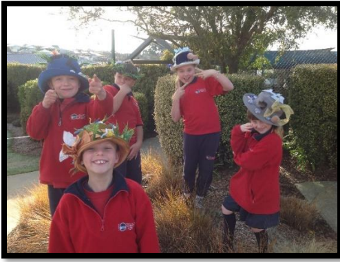
The Thinkaroos group made 'Thinking Hats' to help them expand their thinking knowledge.